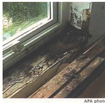
Figure 1: Examples of building damage due to improper flashing and installation. The figure on the left shows damage that occurs behind the building façade, while the picture on the right shows damage at the interior sill of the window.