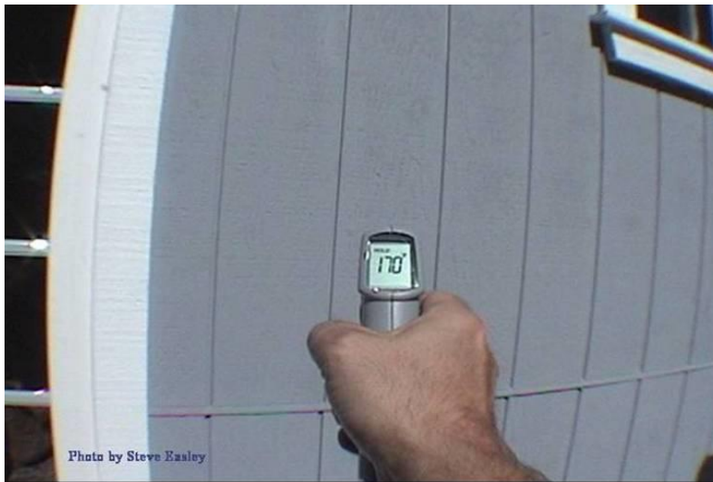
Figure 2: Surface Temperature on a 26.5 °C (80° F) day in Sacramento, California

California, where the surface temperature on grey colored wood siding was measured to be 170° F (76.7° C). It can be easily imagined that on hotter days, or on metal surfaces that received direct or reflected sunlight, the temperatures can easily exceed 80° C.